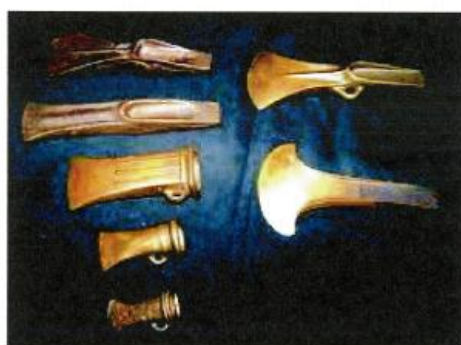
BRONZE AXE HEADS