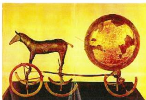
BRONZE SUN CHARIOT