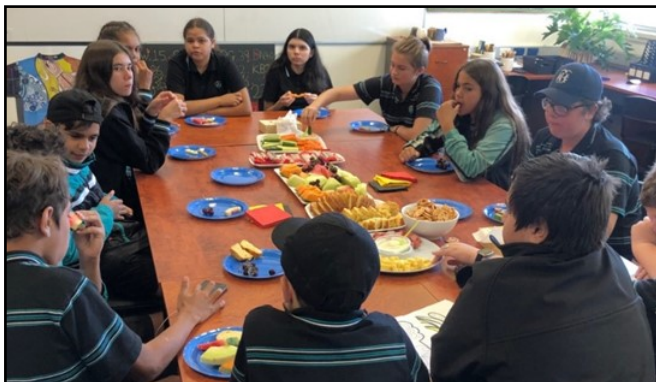
Our Year 8 Students at their introductory morning tea