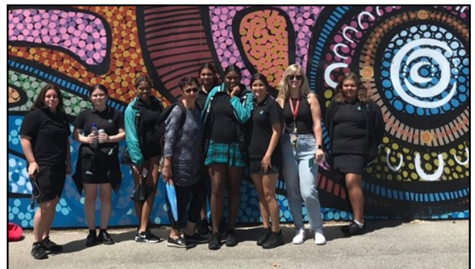
The walk of awareness excursion to Hart's Mill