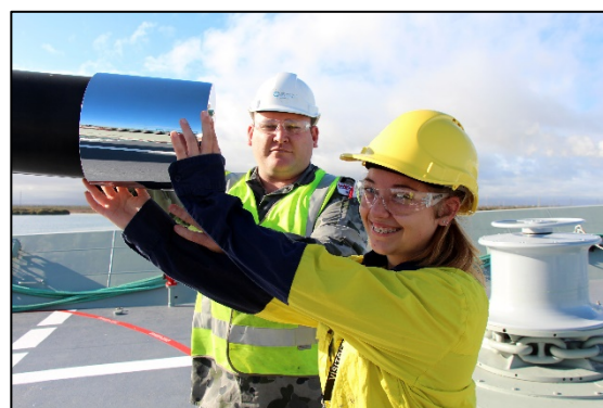
The 2 nd handover to the HMAS Brisbane

The Australian Navy offers young people an array of fantastic careers and Lifelong Learning opportunities. This was a wonderful opportunity for our Engineering students to hear directly from Navy personnel and other associated industries.