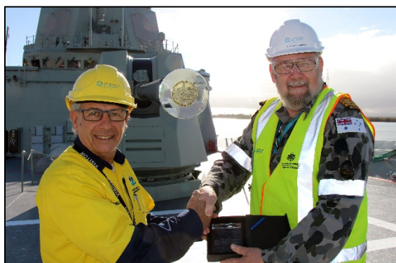
The 1 st handover to the HMAS Hobart