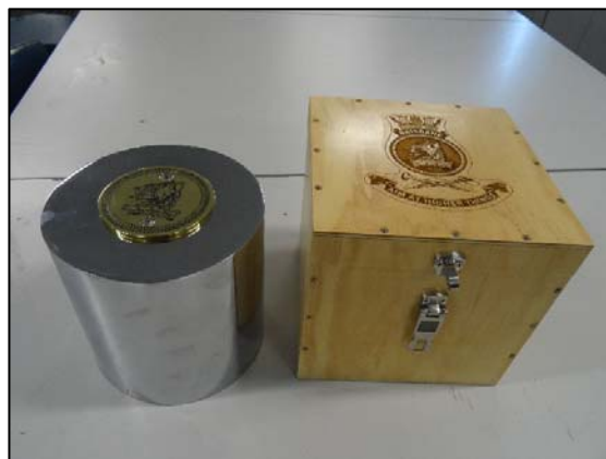
The HMAS Brisbane Tampion and storage box

The three Tampions resulted from a five-year project involving the 2016, 2017, 2018, 2019 and 2020 Engineering classes. The Tampion is 210mm in diameter, by 200mm high, by 3mm thick, rolled steel cylinder with one end sealed. The cylinder is chromed and lined on the inside of the tube with 2mm rubber so it does not scratch or damage the mussel of the gun. As a token gesture the top of the Tampion is engraved with the ships' crest on a 100mm diameter by 5mm brass disc. A storage box with the ships' crest was laser engraved on the top, was made to store the Tampion on board.